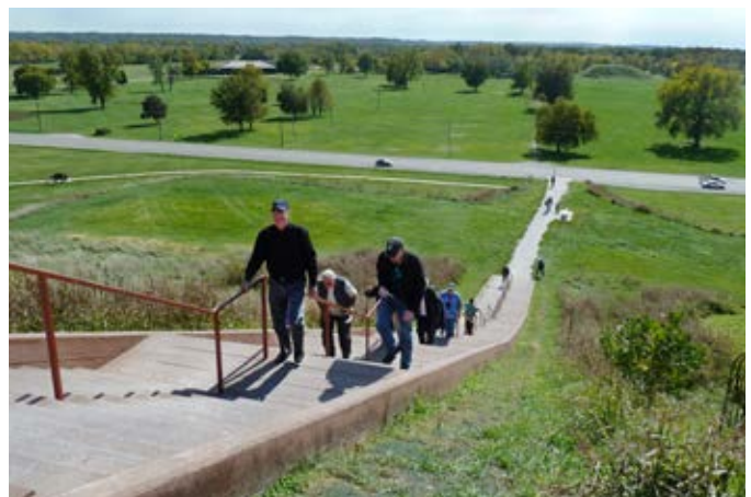
Stair-climb to the top of Monks Mound