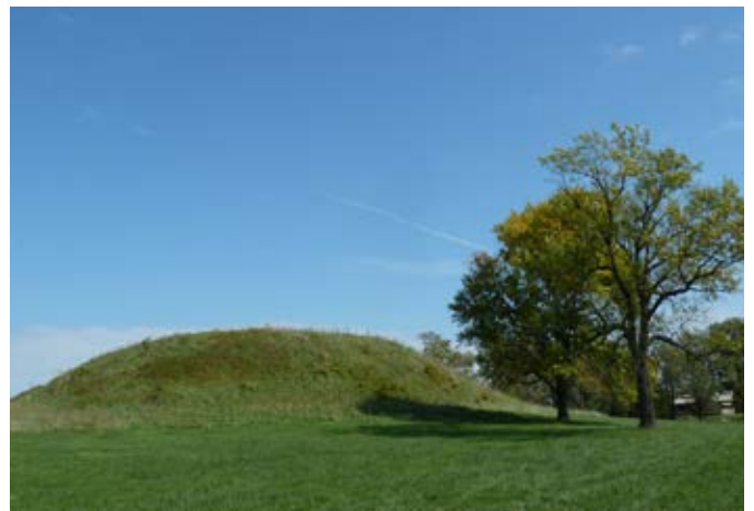
Mound at Cahokia