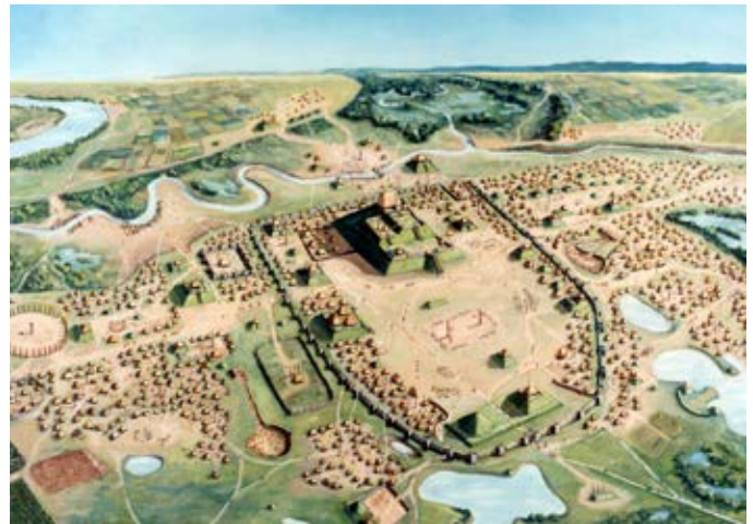
Cahokia aerial by William R. Iseminger Courtesy Cahokia Mounds State Historic Site

Departures out of St. Louis. Plan outgoing flights for any time after 9 a.m. B