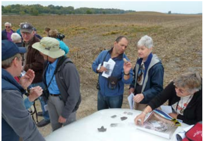
Exploring in the Cahokia region

B = breakfast, L = lunch, D = dinner Itinerary subject to change