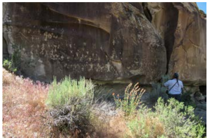
Ancient images come to life on rock walls