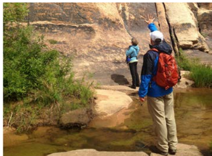
Getting close to exceptional rock art

B = breakfast, L = lunch, D = dinner Itinerary subject to change