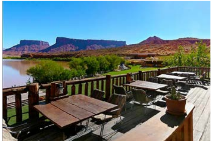
View from Red Cliffs Lodge

Immerse yourself in the rugged and surreal