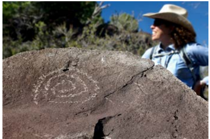
Even simple iconography can hold meaning