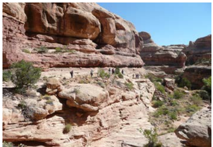
Exploring magnificent canyon corridors