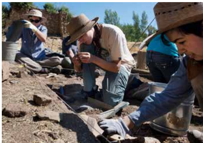
Digging at Crow Canyon's 2018 excavation site