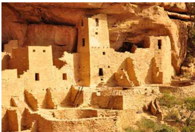
Mesa Verde National Park

Schedule and activities subject to change. Program activities can be modified to accommodate the cultural concerns of American Indian students.