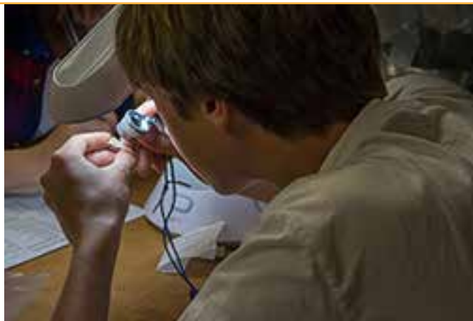
Artifact analysis in the lab

All campus meals are served cafeteria-style in the lodge. Meals away from campus are served picnic-style. Students purchase two restaurant meals on weekend excursions.