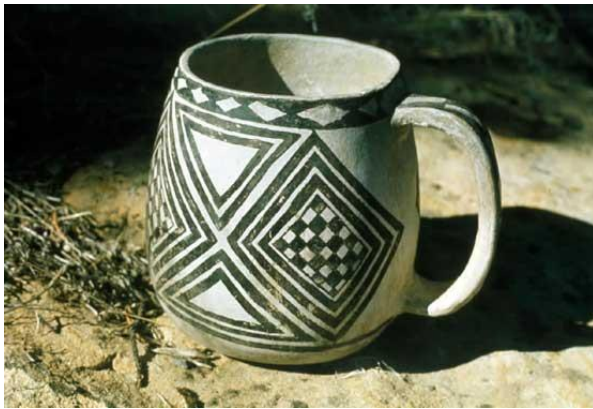
Mug – http://www.nps.gov/meve/learn/education/artifactgallery_mug.htm

Explain how the artifact demonstrates the ways Ancestral Pueblo people used natural resources from the region to meet their fundamental human needs.