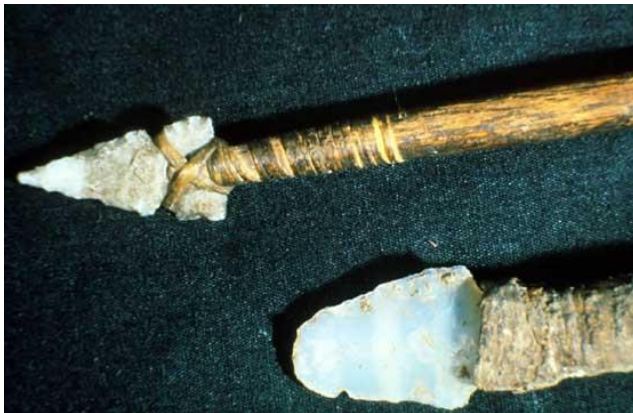
Stone spear and knife – http://www.nps.gov/meve/learn/education/artifactgallery_spearknife.htm